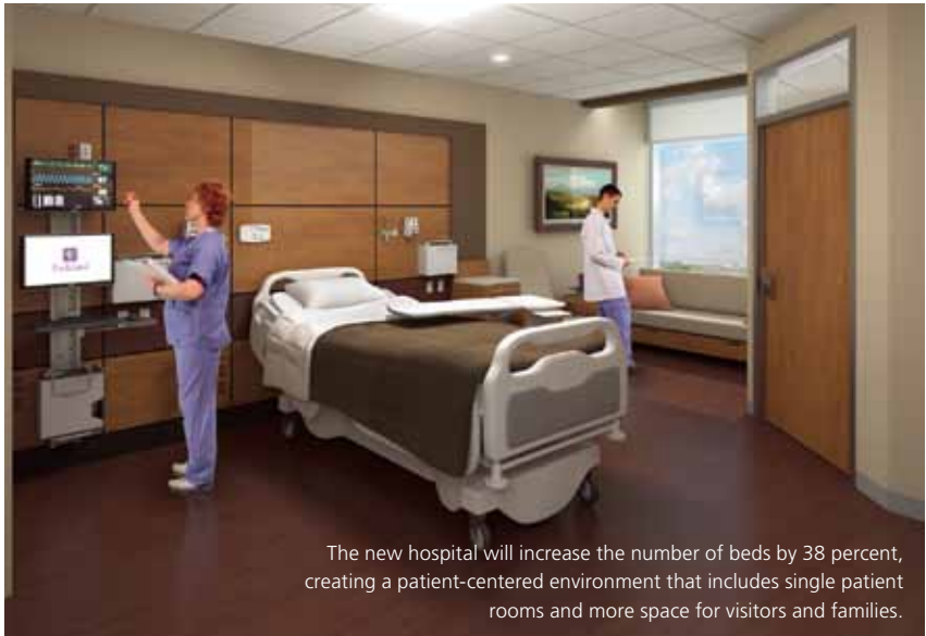
The new hospital will increase the number of beds by 38 percent, creating a patient-centered environment that includes single patient rooms and more space for visitors and families.